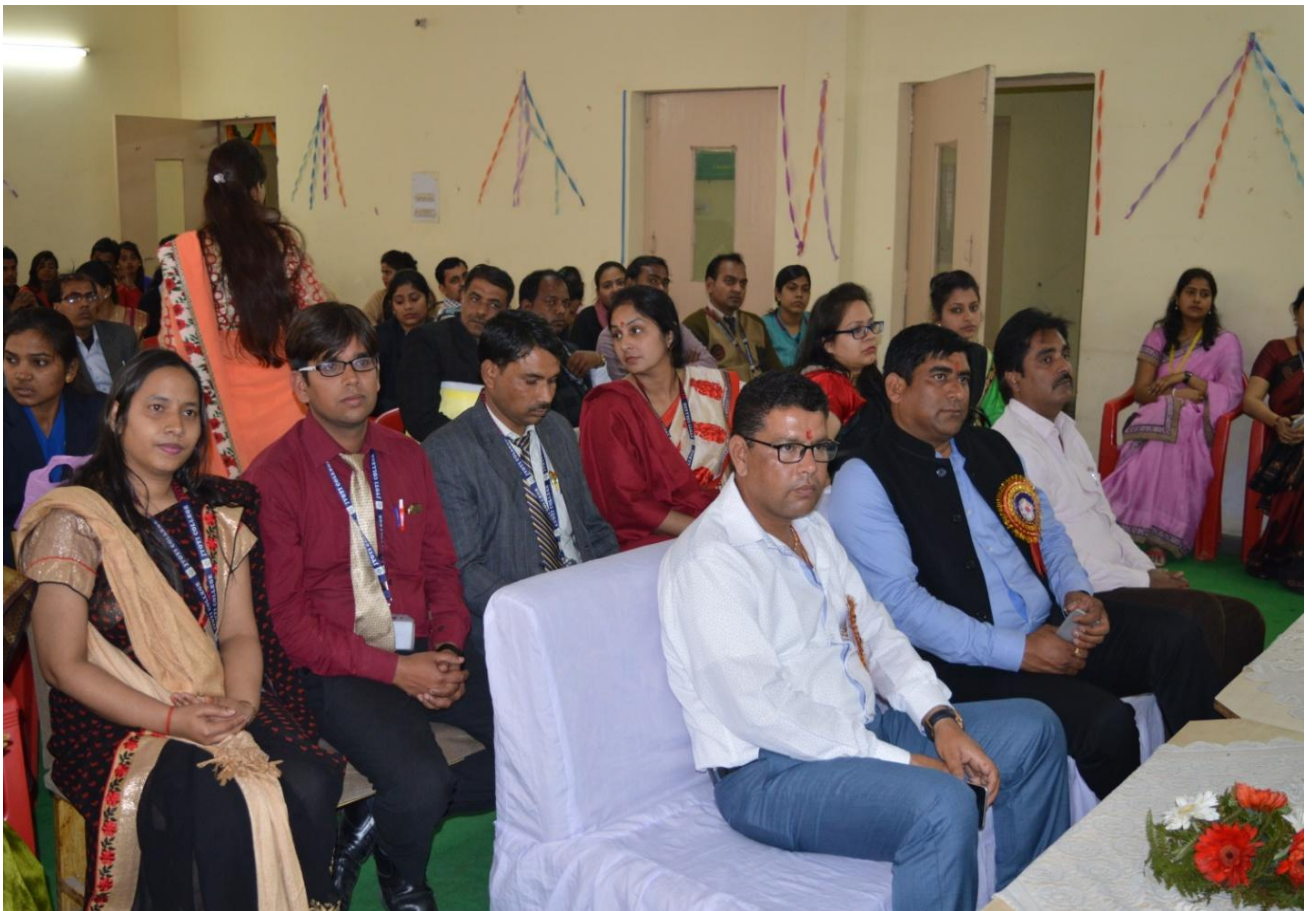
Technical Session and Delegates Presenting the Paper