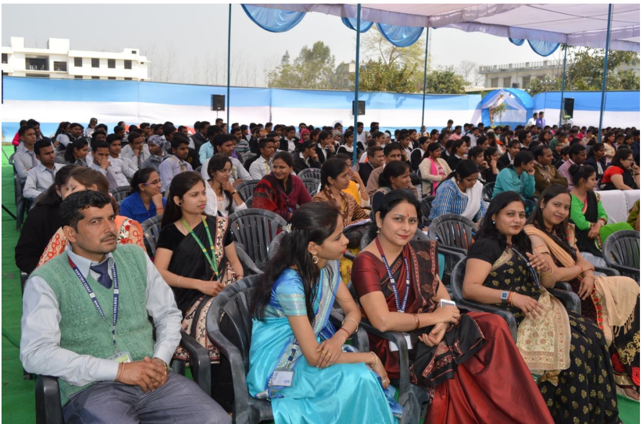
Releasing of Souvenir and Gathering of the Participants